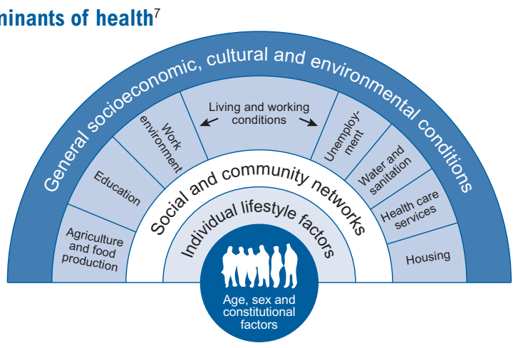
Figure 1. Social determinants of health<sup>7</sup>

Men's health and wellbeing is the joint responsibility of many agencies and departments beyond the WA health system and necessitates a collaborative approach to achieve common goals.